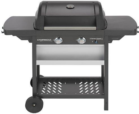
2 SERIES CLASSIC L CLASS 2 L