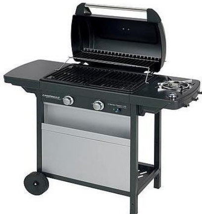
2 SERIES CLASSIC LXS