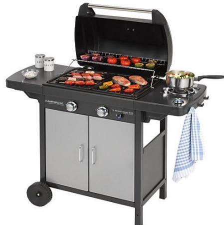
2 SERIES CLASSIC EXS 2 SERIES CLASSIC EXS VARIO