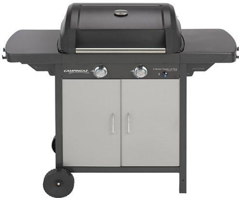
2 SERIES CLASSIC LX PLUS