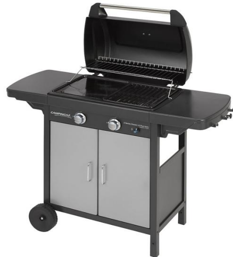
2 SERIES CLASSIC LX PLUS VARIO CLASS 2 LX PLUS VARIO