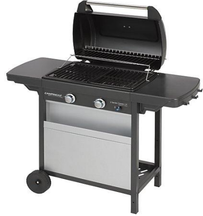
2 SERIES CLASSIC LX 2 SERIES CLASSIC LX VARIO CLASS 2 LX VARIO