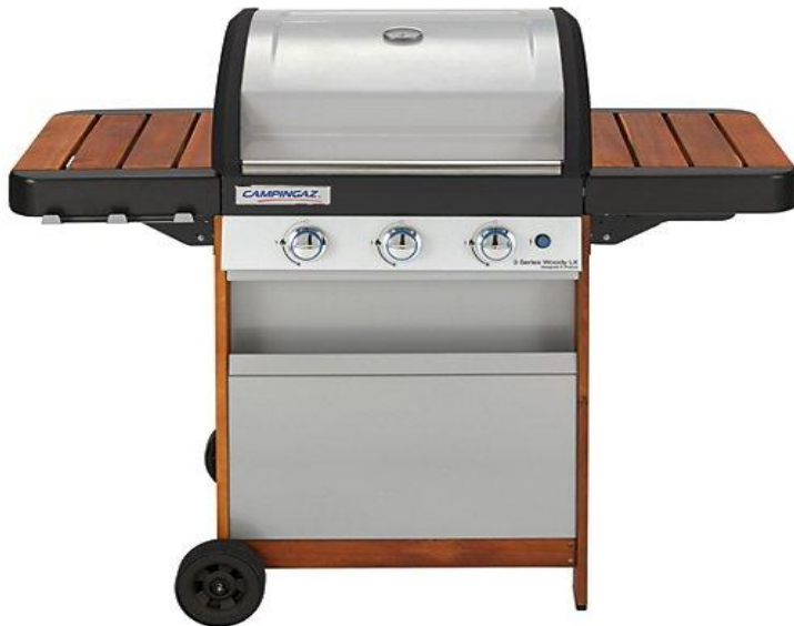
3 SERIES WOODY LX