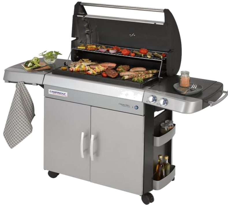
3 SERIES RBS L CLASS 3 RBS L