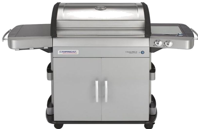
3 SERIES RBS LS