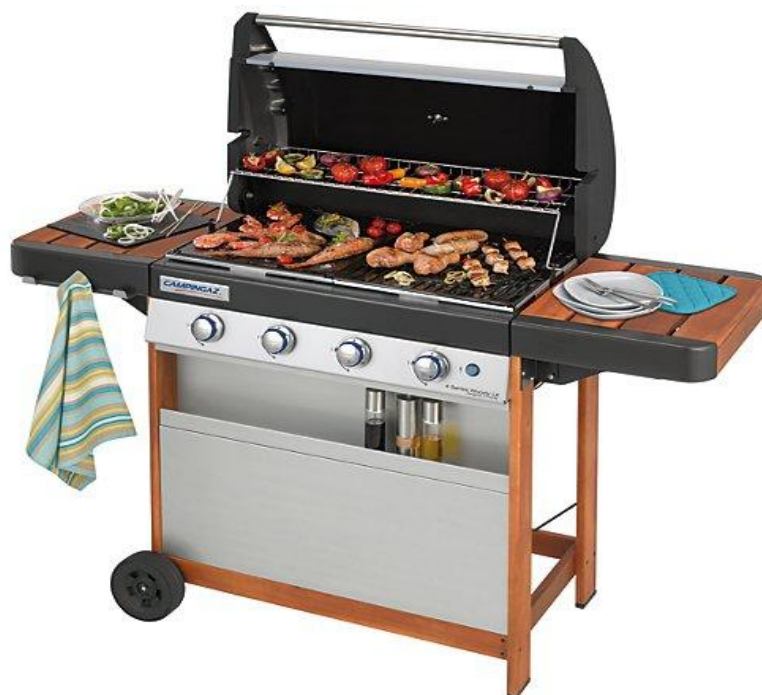
4 SERIES WOODY LX