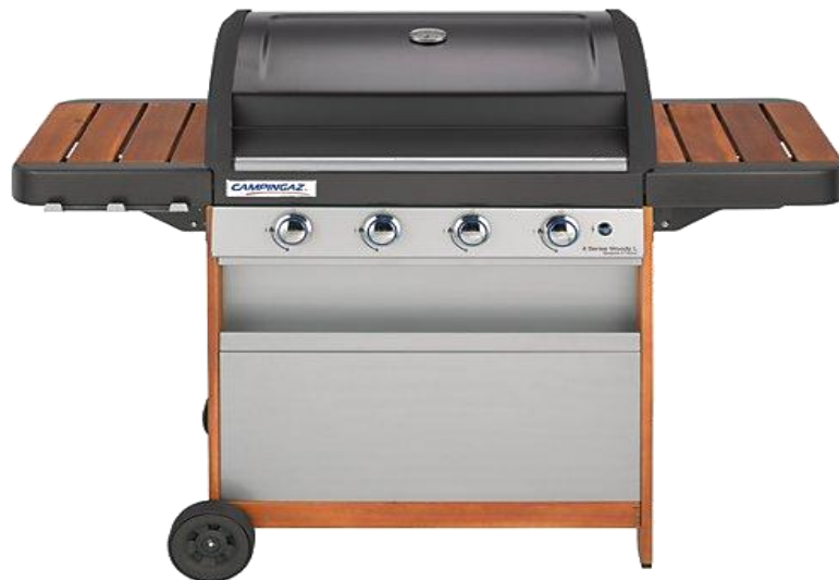
4 SERIES WOODY L