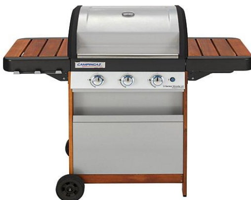
3 SERIES WOODY LX