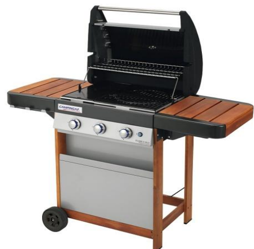
CLASS 3 WLX (ELECTRONIC) CLASS 3 WLX FR (PIEZO)