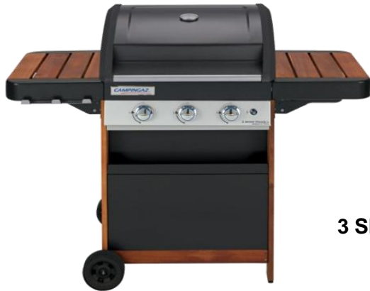
3 SERIES WOODY L