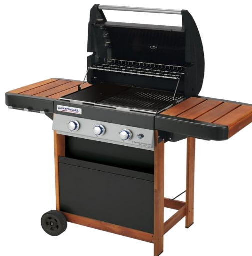
3 SERIES WOODY LD